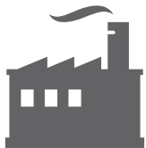
Industrial Fluid Handling