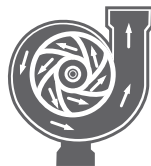
Up-Feed Pump Systems