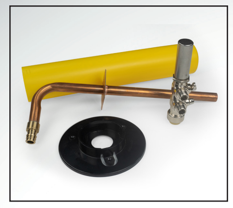
The StopOut kit includes: ABS mounting plate, copper stub out elbow with plate bracket, <sup>1</sup>/<sub>4</sub>-Turn push-fit valve, and durable debris cover