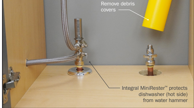
Remove debris covers and connect supply lines. Arrester models are perfect for sink and dishwasher on hot side, or sink and ice maker on the cold side.