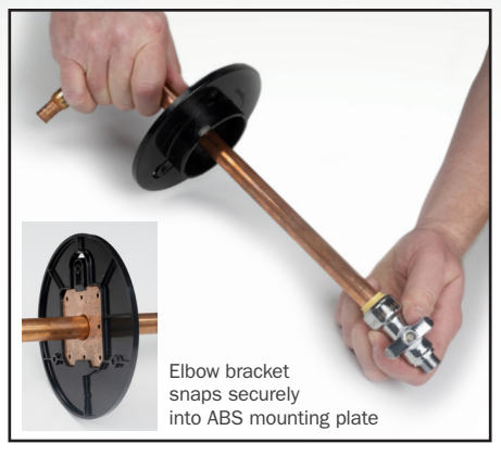
Attach the copper elbow to the mounting plate. Then connect valve to the end of the stub out - Be sure valve is OFF.