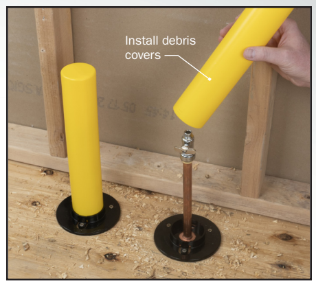
Measure for location/centers and drill 1" holes in sub floor. Insert elbows and fasten plates with three screws. Cover stub out and valve with debris cover